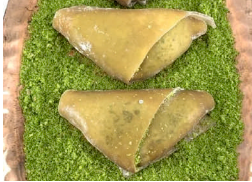
Amulet Baklava with Pistachio