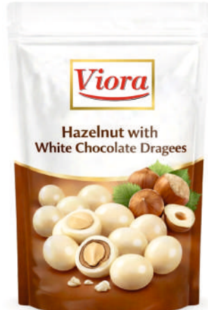
Hazelnut with White Chocolate Dragees