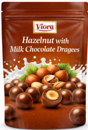
Hazelnut with Milk Chocolate Dragees