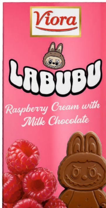
Labubu Chocolate Raspberry Cream