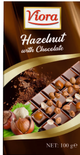
Hazelnut with Chocolate