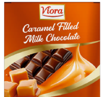
Caramel Filled Milk Chocolate