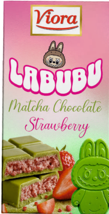
Labubu Chocolate Matcha Tea & Strawberry