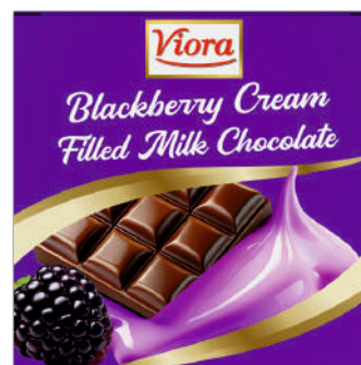
Blackberry Cream Filled Milk Chocolate