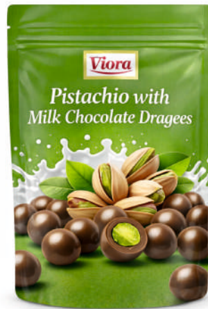
Pistachio with Milk Chocolate Dragees