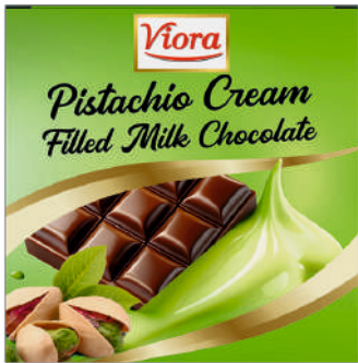
Pistachio Cream Filled Milk Chocolate