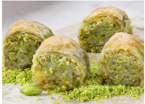
Large Antep Special with Pistachio