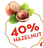
Milky Cream with Hazelnut