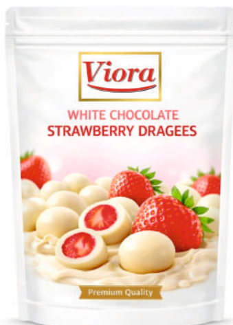
Strawberry with White Chocolate Dragees