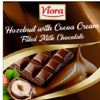
Hazelnut with Cocoa Cream Filled Milk Chocolate