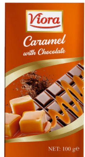
Caramel with Chocolate