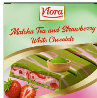
Matcha Tea and Strawberry White Chocolate