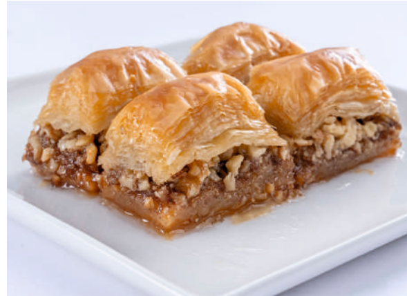
Baklava with Walnut