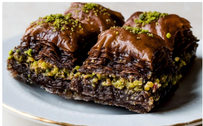
Chocolate with Pistachio