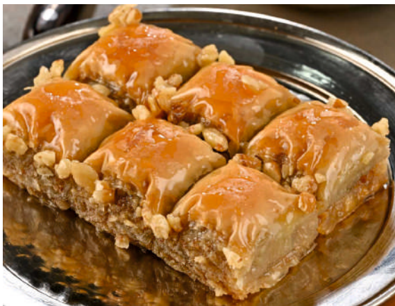
Special Antep Baklava with Walnut