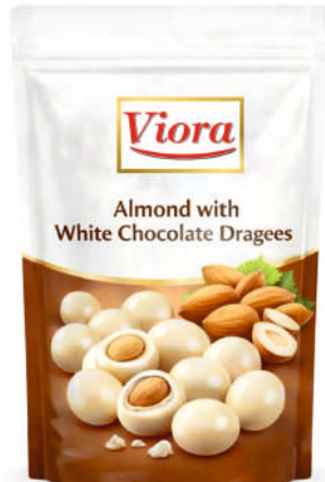
Almond with White Chocolate Dragees