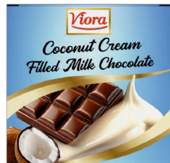
Coconut Cream Filled Milk Chocolate