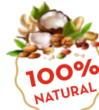
Mix Nut Cream