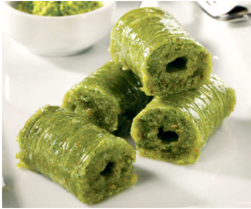
Dolama with Pistachio