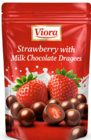
Strawberry with Milk Chocolate Dragees