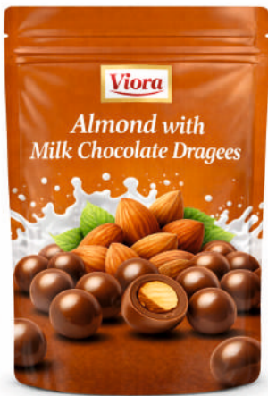
Almond with Milk Chocolate Dragees