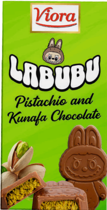
Labubu Dubai Chocolate