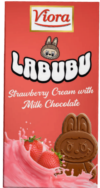
Labubu Chocolate Strawberry Cream