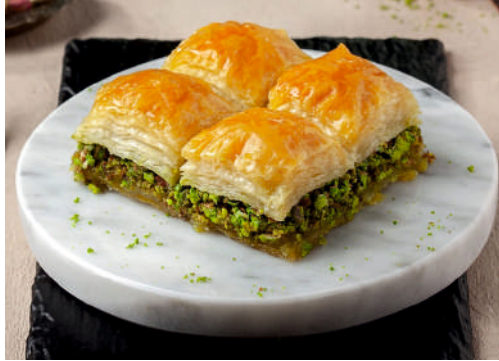
Square Baklava with Pistachio