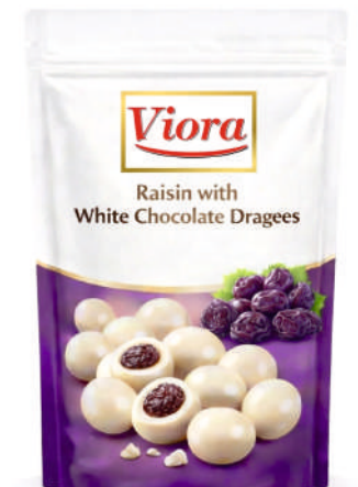
Raisin with White Chocolate Dragees