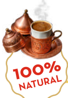
Turkish Menengic Coffee