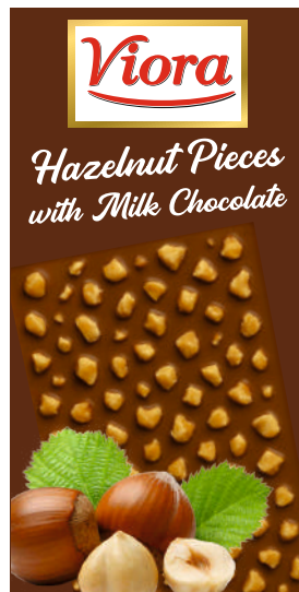
Hazelnut Pieces with Milk Chocolate