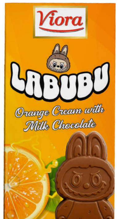
Labubu Chocolate Orange Cream