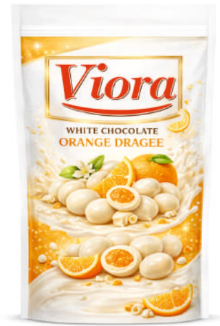
Orange with White Chocolate Dragees