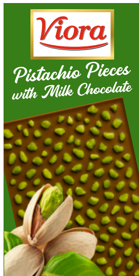
Pistachio Pieces with Milk Chocolate