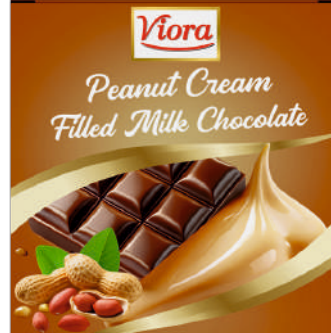
Peanut Cream Filled Milk Chocolate