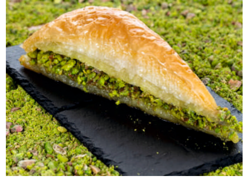
Triangle Baklava with Pistachio