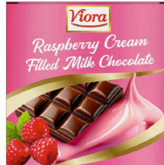
Raspberry Cream Filled Milk Chocolate