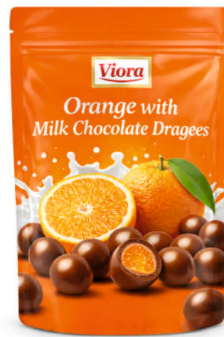
Orange with Milk Chocolate Dragees