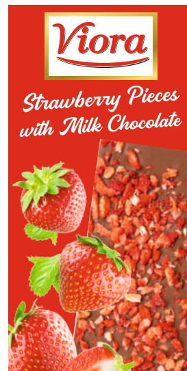
Strawberry Pieces with Milk Chocolate