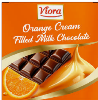
Orange Cream Filled Milk Chocolate