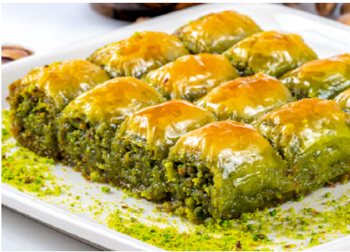
Special Antep Baklava with Pistachio