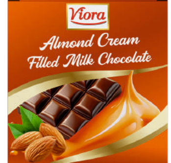
Almond Cream Filled Milk Chocolate