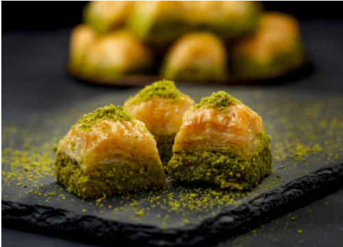
Baklava with Pistachio