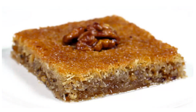
Plain Kadayif with Walnut