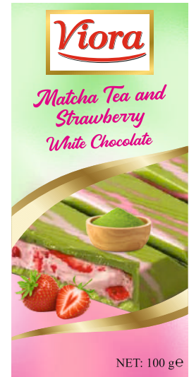
Matcha Tea and Strawberry White Chocolate