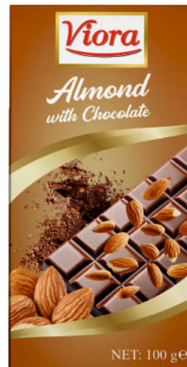
Almond with Chocolate