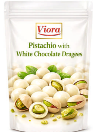
Pistachio with White Chocolate Dragees