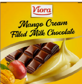
Mango Cream Filled Milk Chocolate