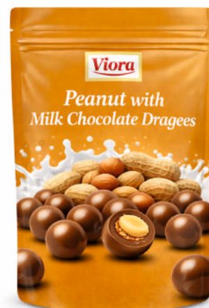
Peanut with Milk Chocolate Dragees