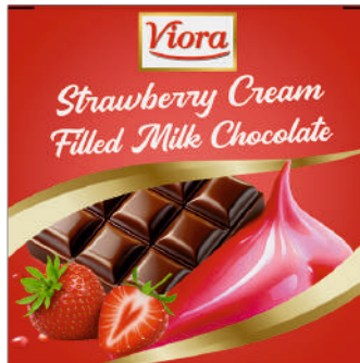
Strawberry Cream Filled Milk Chocolate