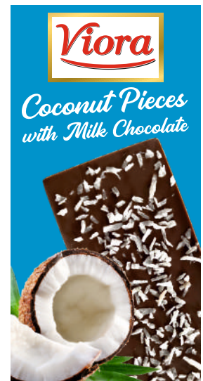
Coconut Pieces with Milk Chocolate