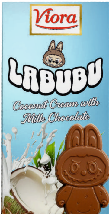
Labubu Chocolate Coconut Cream