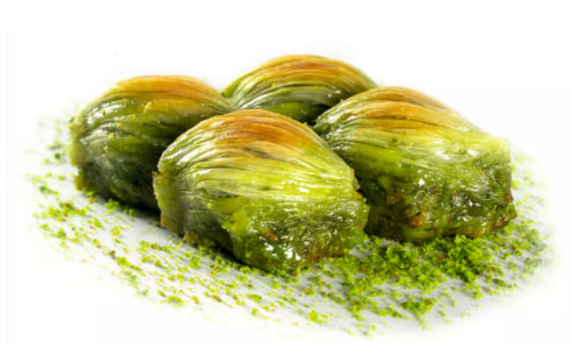
Mussel Baklava with Pistachio